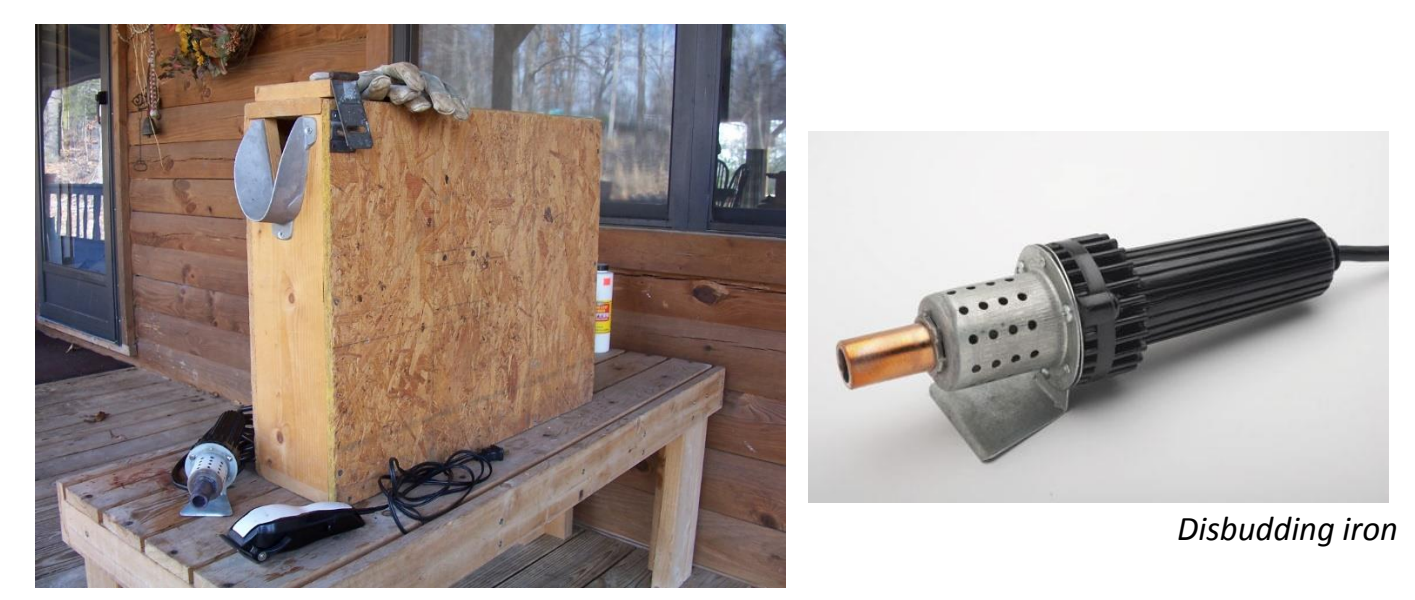
Kidding box and supplies.

The equipment that you will need to disbud is a disbudding iron (available at feed stores or online livestock supply stores), a board to test the iron, and clippers to remove the hair around the horn buds. A kidding box is also extremely helpful, especially if you are limited on extra hands around the farm. There are many plans available online that can be made specific to your breed of goat.