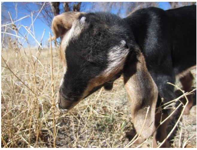
Horn buds that are too large