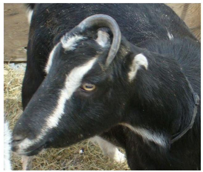
Doe with scurs from improper disbudding