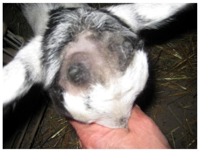
Proper size of horn buds